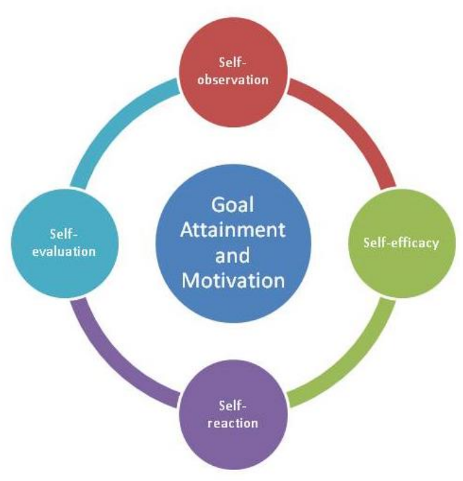
Figure 3: Processes of goal realisation