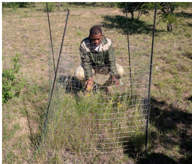
Figure 4. Initially used exclosures made from fencing wire.

Forage chemical analysis. Dried forage samples were ground to pass through a 1 mm sieve and stored in air-tight plastic bottles pending chemical analysis. Nitrogen (N) was determined using the Kjeldahl method (AOAC 1999; method number 976.06) and neutral detergent fiber (NDF) and acid detergent fiber (ADF) by the method of Van Soest et al. (1991). Calcium (Ca), magnesium (Mg), potassium (K), copper (Cu), zinc (Zn), manganese (Mn) and iron (Fe) concentrations were determined using the dry-ashing macro- and trace minerals method following the guidelines of the Agri-Laboratory Association of Southern Africa (Palic et al. 1998). Phosphorus (P) was analyzed using an ultraviolet spectrophotometer, K by using a flame photometer and Ca, Mg, Fe, Zn and Cu by using an atomic absorption spectrophotometer (PerkinElmer 1982). Limited funds allowed forage samples collected during only 2017 to be analyzed.