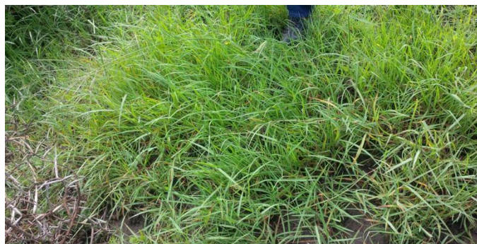
Figure 3. Available biomass at removal of the brush pack.

Forage chemical analysis. Dried forage samples were ground to pass through a 1 mm sieve and stored in air-tight plastic bottles pending chemical analysis. Nitrogen (N) was determined using the Kjeldahl method (AOAC 1999; method number 976.06) and neutral detergent fiber (NDF) and acid detergent fiber (ADF) by the method of Van Soest et al. (1991). Calcium (Ca), magnesium (Mg), potassium (K), copper (Cu), zinc (Zn), manganese (Mn) and iron (Fe) concentrations were determined using the dry-ashing macro- and trace minerals method following the guidelines of the Agri-Laboratory Association of Southern Africa (Palic et al. 1998). Phosphorus (P) was analyzed using an ultraviolet spectrophotometer, K by using a flame photometer and Ca, Mg, Fe, Zn and Cu by using an atomic absorption spectrophotometer (PerkinElmer 1982). Limited funds allowed forage samples collected during only 2017 to be analyzed.