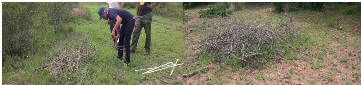
Figure 2. Exclosures made from brush packs.

SRSG = Shallow, red stony ground; SDSL = Shallow, dark sandy loam; DCL = Deep, dark clay-loam.