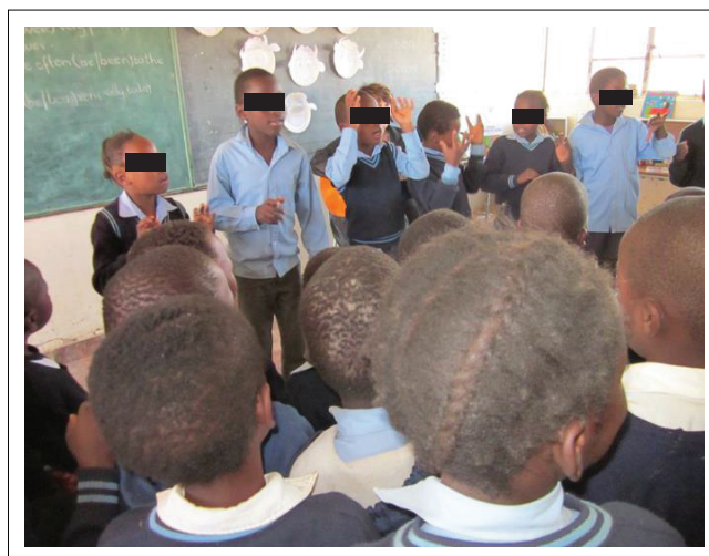
FIGURE 2: Interactive concert that took place at the end of the project including the entire school.

All sessions shared a similar format: greeting, singing previously learnt songs and a quiz about previously-learnt vocabulary. After the revision, a new song was learnt and repeated several times with a focus on linking subject content, art elements and principles as well as vocabulary. To assist with vocabulary, pictures were sometimes used as additional resources. A variety of percussion instruments were used in different combinations as song accompaniment. New vocabulary was added to the word wall and then followed by an art activity and/or completion of a worksheet. At the end of each session, the new song was repeated. Some educators often came in to join the lessons.