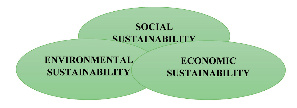
Figure 3. Pillars of sustainable development (SD).

[24] Defines sustainable development as a process of economic development that does not compromise the future generations but conserves the natural resources for them. [22] Suggests that the development that satisfies the needs of the current generation, no depriving the future generations the ability to satisfy their needs is sustainable development. Sustainable development is mostly known for its three (3) pillars, namely: social, environmental and economic sustainability [2, 22–24]. This means that any development happening, must be economic equitability, it must be socially bearable, and environmental viability ( Figure 3 ).