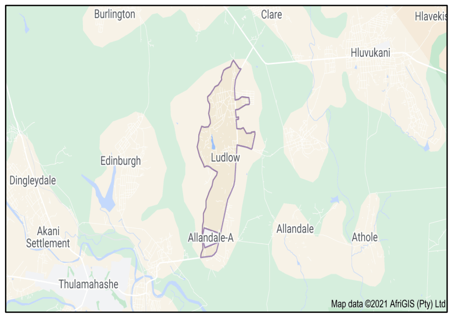
Figure 1. Map of the two study areas

Bushbuckridge Municipality is bonded by Kruger National Park in the East and Mbombela to the South. It provides a gate way to Limpopo Province and consisting of 135 settlements divided into 34 wards. Bushbuckridge local Municipality has a total population of 541 248 with 99.5% black community and other population group accounting for 0.5%. Agricultural household activities are diverse with 17.9% livestock farmers, 37.5% poultry, 18.8% vegetables, and other crops 20.6%. Ludlow is in Bushbuckridge Local Municipality, with a total population of 5,766, GPS coordinates of 24.6716 S, 31.278 E. The number of households is put at 53,204 with 13,103 livestock farmers. Hluvukani is also in Bushbuckridge local municipality, with GPS coordinates: 24.6475 S, 31.3505 E) and a total population of 9631(South African National Census of 2011).