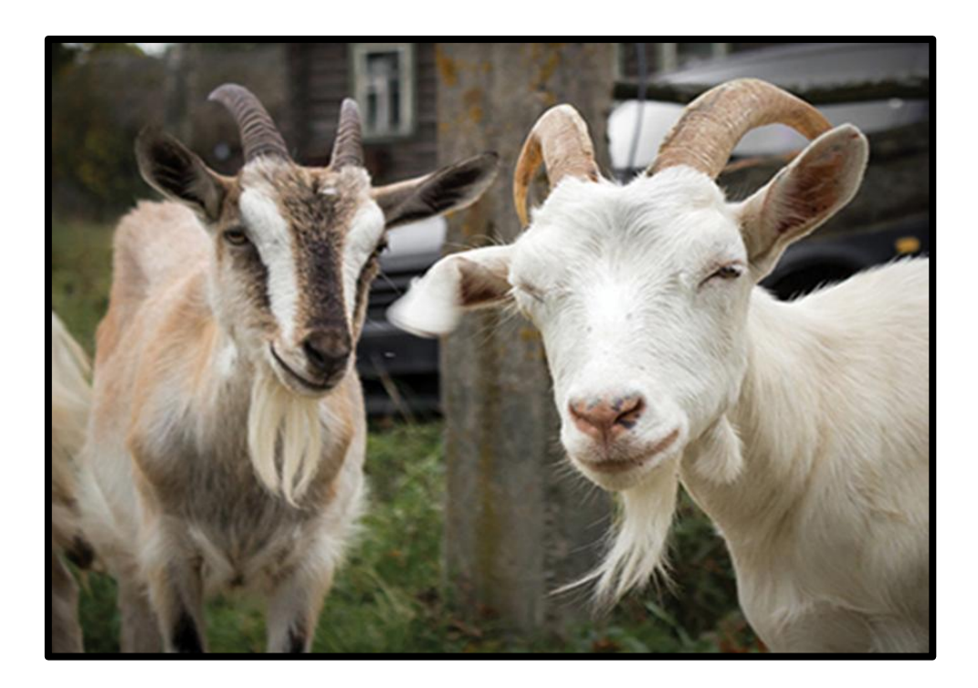
Figure 1: A cross section of goats in the study area